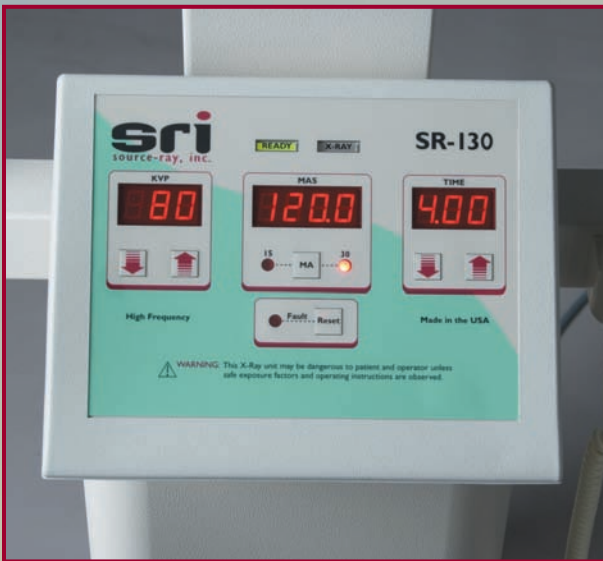
(Complies with CFR 21 Subchapter J)

considering the purchase of a CR-System. CR-Systems currently operate at 200 speed. The SR-130 provides the power required to compensate for this slower operating speed without compromising image quality. The SR-130 is a user friendly system designed for high reliability and the durability required for the Diagnostic Outreach market. The SR-130 can be used in hospitals, clinics, nursing homes, private homes, orthopedic practices, sports medicine, correctional facilities and military field deployable applications.